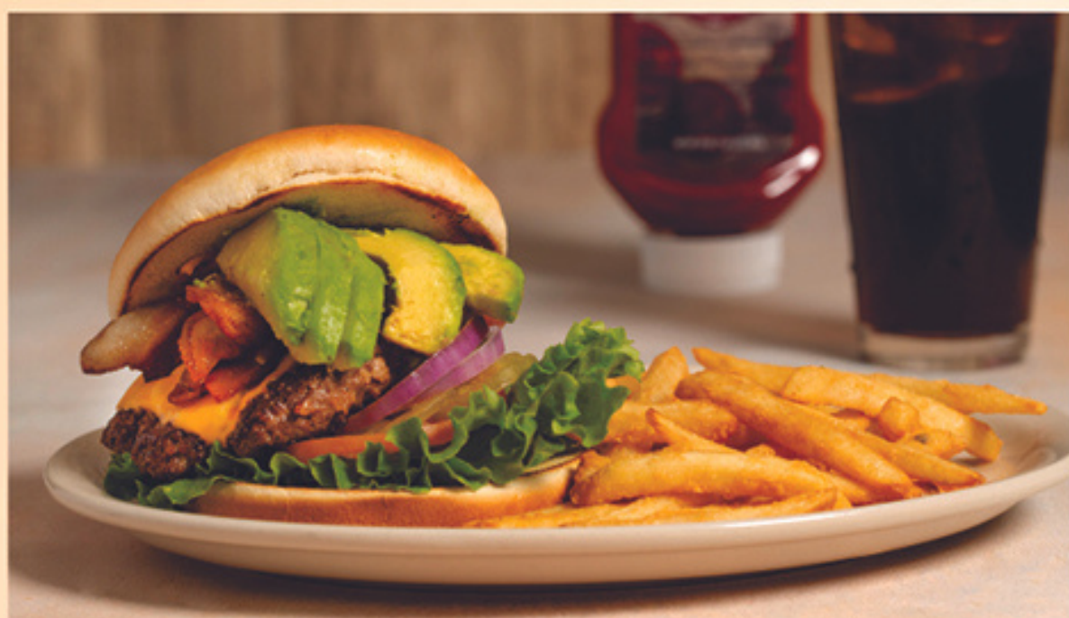
With Mustard or Mayo, Lettuce, Onions, Pickles, Tomatoes Served with French Fries Substitute Onions Rings, House Salad or Soup for additional $1.00